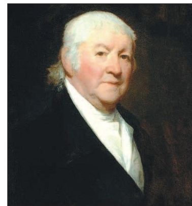
1813 portrait of Paul Revere by Gilbert Stuart.

Those words from the Midnight Ride of Paul Revere, the famous poem written by Henry Wadsworth Longfellow in 1860, probably brought more confusion about that infamous night than history remembers.