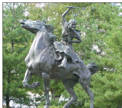
A statue of Sybil Ludington, sculpted by Anna Hyatt Huntington, was erected in Carmel, New York, in 1961.