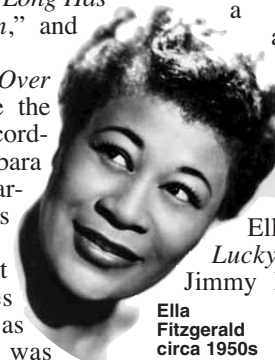
Ella Fitzgerald circa 1950s

Ella's album of just the Gershwin tunes was available earlier as a ten-inch LP and was heavily used as a training manual in conservatory seminars on how to sing Gershwin. The secret of her vocal gifts is, I think, in the unfussy and straight forward approach she takes to each selection, letting the sentiment, poetry, and charm exude their spell. The song, "Looking For A Boy," is a