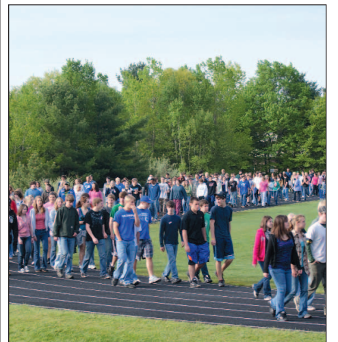
Erskine students walk around the school's track to raise money for the Walk to Cure Breast Cancer campaign.

The group would like to sincerely thank all who pledged and walked as well as the following businesses for their generous support: Back's Dairy Bar, Hannaford Supermarkets, EJ Prescott, Ray Haskell Ford, and North Country Harley Davidson.