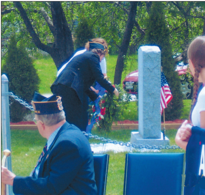
Participants in last year's Memorial Day parade in South China lay a wreath at the monument at Veterans Park in South China Village.