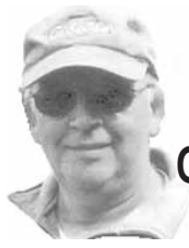
by Roland D. Hallee

Tree swallows are elegant birds with white undersides, iridescent blue-green backs, and moderately forked tails. Seen in profile, this swallow has a sharp line of demarcation