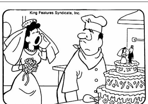
Find at least six differences in details between panels.