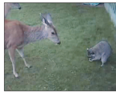
Deer and raccoons are two of the most common garden pests.

Anyhow, if a fence or dogs are not feasible, there are a few products on the market that act as animal repellents. Hot pepper wax is used to keep away animals as well as insects. Coyote urine may deter deer, and so might man's urine. Bars of soap hung in pantyhose on a tree limb, could be the more pleasant smelling option; the more perfumed the